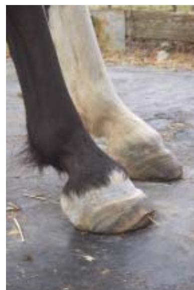
AFTER TWO MONTHS

After four months she went home to her own farm, not quite sound, but a very willing walker. The protrusions had healed over and new connection in the laminae had reached ground level at the heels. This was an amazing rate of recovery on the rubber longyard. At this stage she was given Bowen treatments and the healing really progressed.