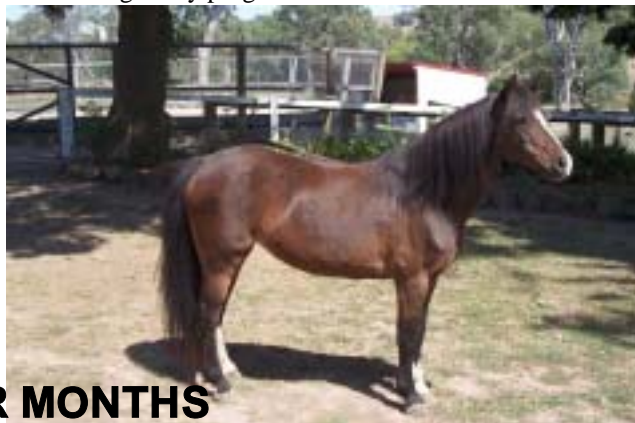
AFTER FOUR MONTHS

It is now 13 th May 05 (6months after arriving at Mayfield) and Jenny Wren is back under saddle. She is close to 100% right with new connection now grown past the centre of gravity (to the front of the frog). It has been a big job but Jenny Wren is a real little battler who never even thought about giving up. Hopefully her story may help to show others what is possible with bare hoof rehabilitation. Serious laminitis and even pedal bone penetration is no longer a death sentence.